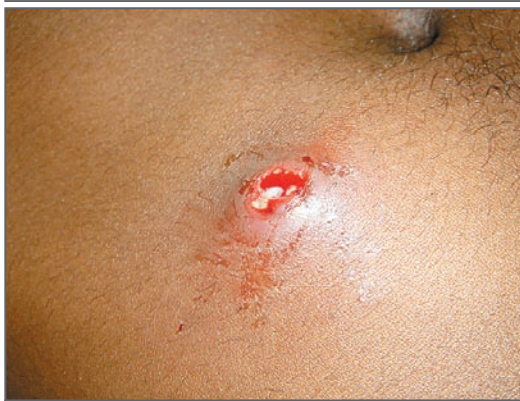
Figure 1. Anterior Abdominal-Wall Abscess in a 15-Year-Old Boy.

Skin and soft-tissue infections represent the majority of the community-associated MRSA disease burden 27 and are the focus of this article. Examples of such infections are shown in Figures 1 and 2. (Other examples are in the Supplementary Appendix, available with the full text of this article at www.nejm.org .) Necrotic skin lesions are a common presentation and are often incorrectly attributed to bites by brown recluse spiders